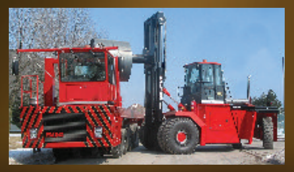
Shortest wheel base in its class and smallest turning radius in the industry.