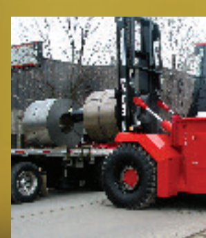
The unique features of this e operating costs through incre