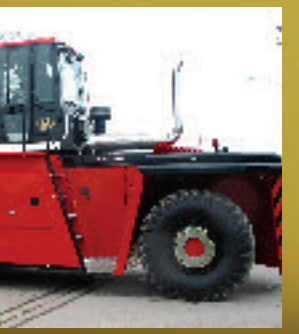
quipment result in lower ased productivity.