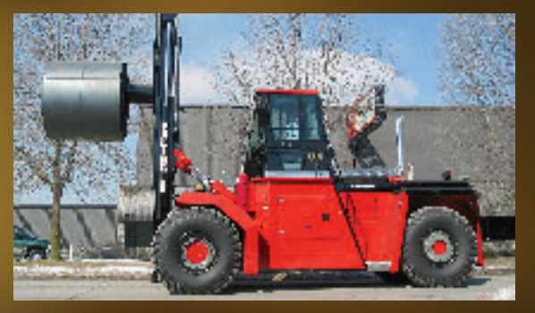
With more standard features than any other equipment in its class, Paling takes material handling to a whole new level.