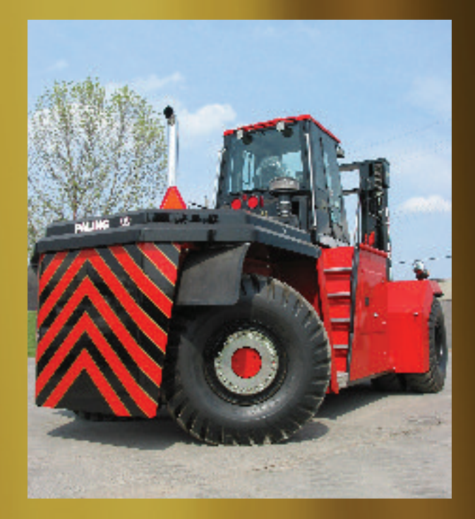
Designed with technology to extend service life and minimize maintenance cost.