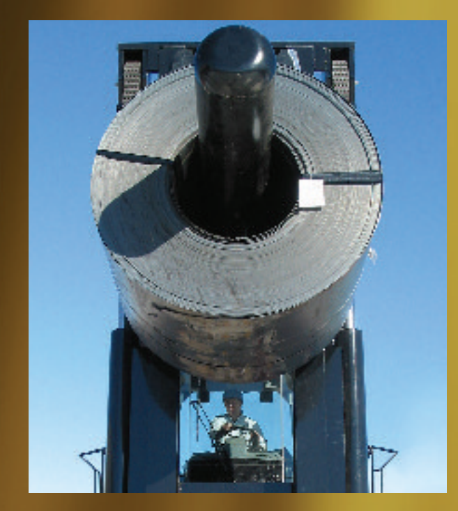
Truly the next generation in material handling equipment with the best warranty in the business.