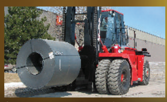
Superb visibility increases operator confidence and minimizes accidents.